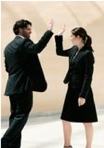
Competitive but together...