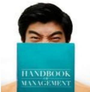
How to manage myself in today's society?

Although long overdue, any comparative analysis of SCHE in Europe and the United States is bound to face an important number of challenges posed by the historical development of SCHE.